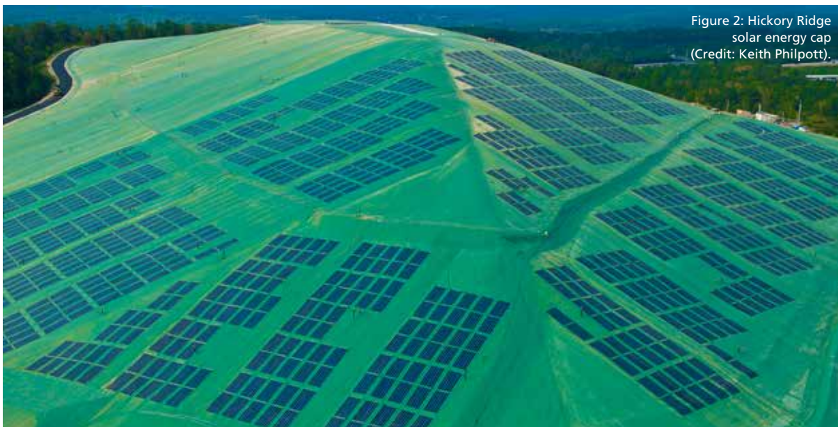
Figure 2: Hickory Ridge solar energy cap.